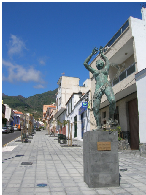
Point A (meeting point)